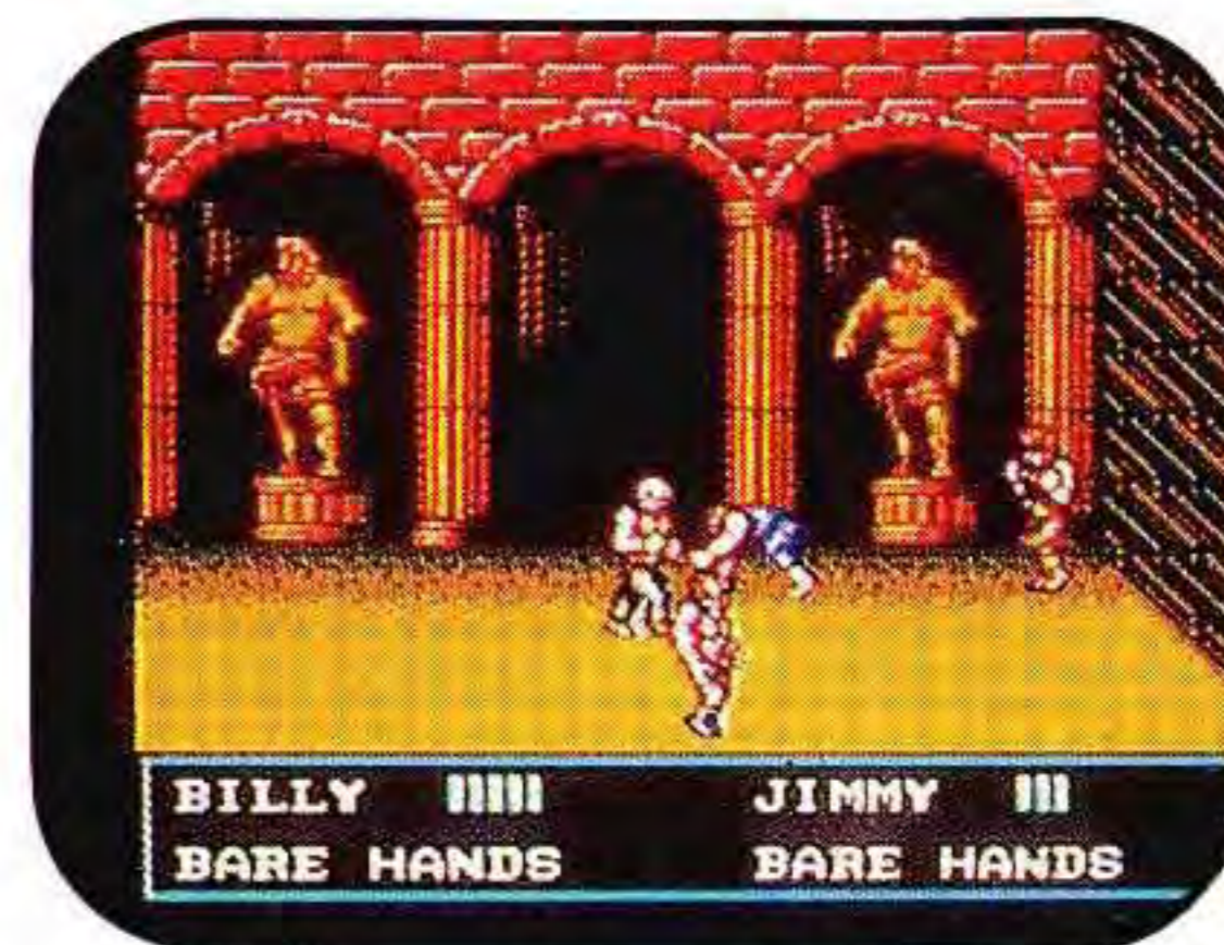
The Mid-Air Somer Assault is your newest martial arts maneuver!

MID-AIR SOMER-ASSAULT — Devastating! Use this one to do a full flip and send your opponent flying through the air. With the CONTROL PAD ARROW pressed in the direction of your opponent, press the A & B BUTTONS simultaneously , then immediately press the A BUTTON again. (For a FLYING JUMP KICK, press the B BUTTON instead).