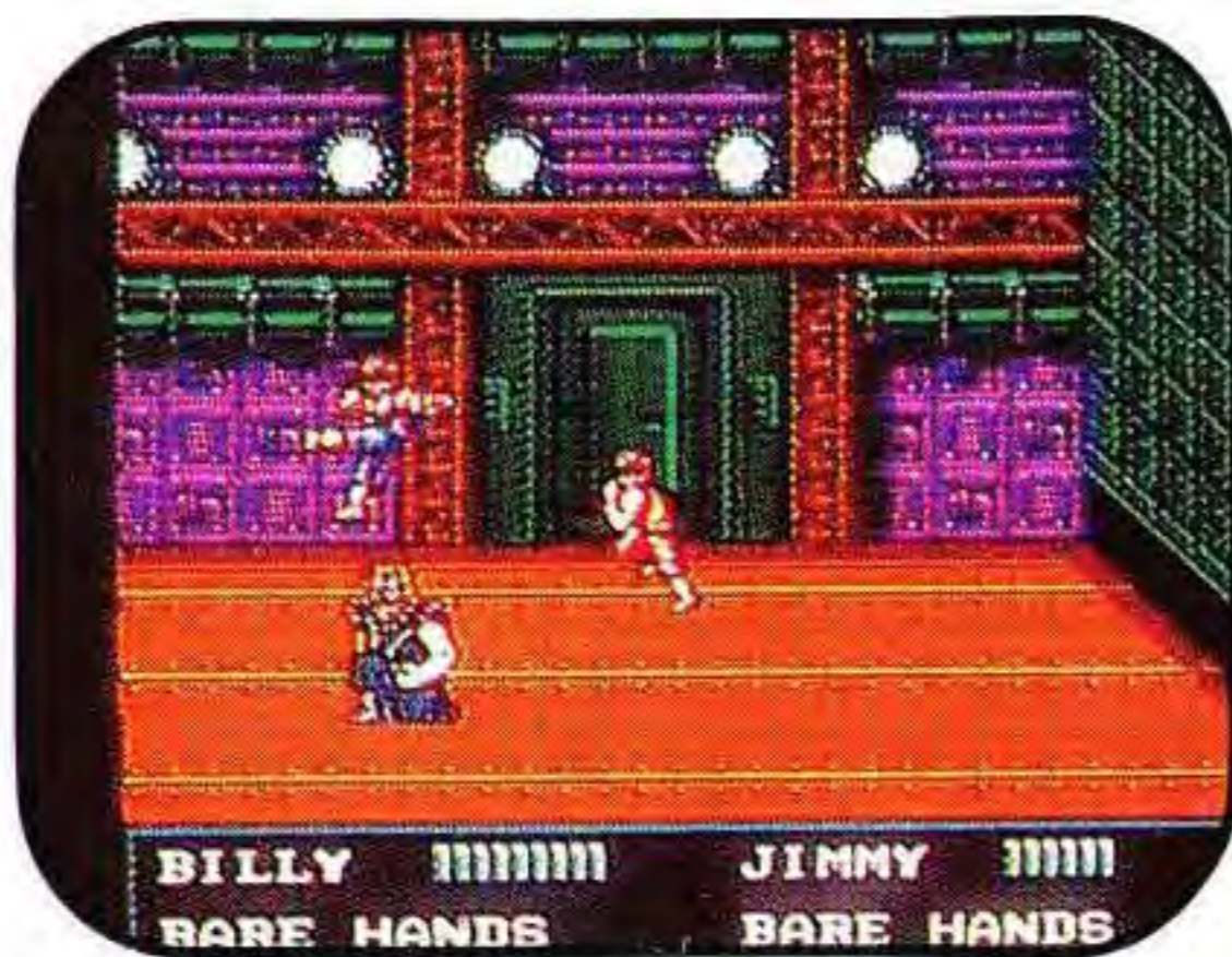
The incredible cyclone spin kick!

CYCLONE SPIN KICK — To spin 360 degrees in mid-air with your leg extended, jump by pressing both the A & B BUTTONS simultaneously (make sure you're not moving), then immediately press the B BUTTON again.