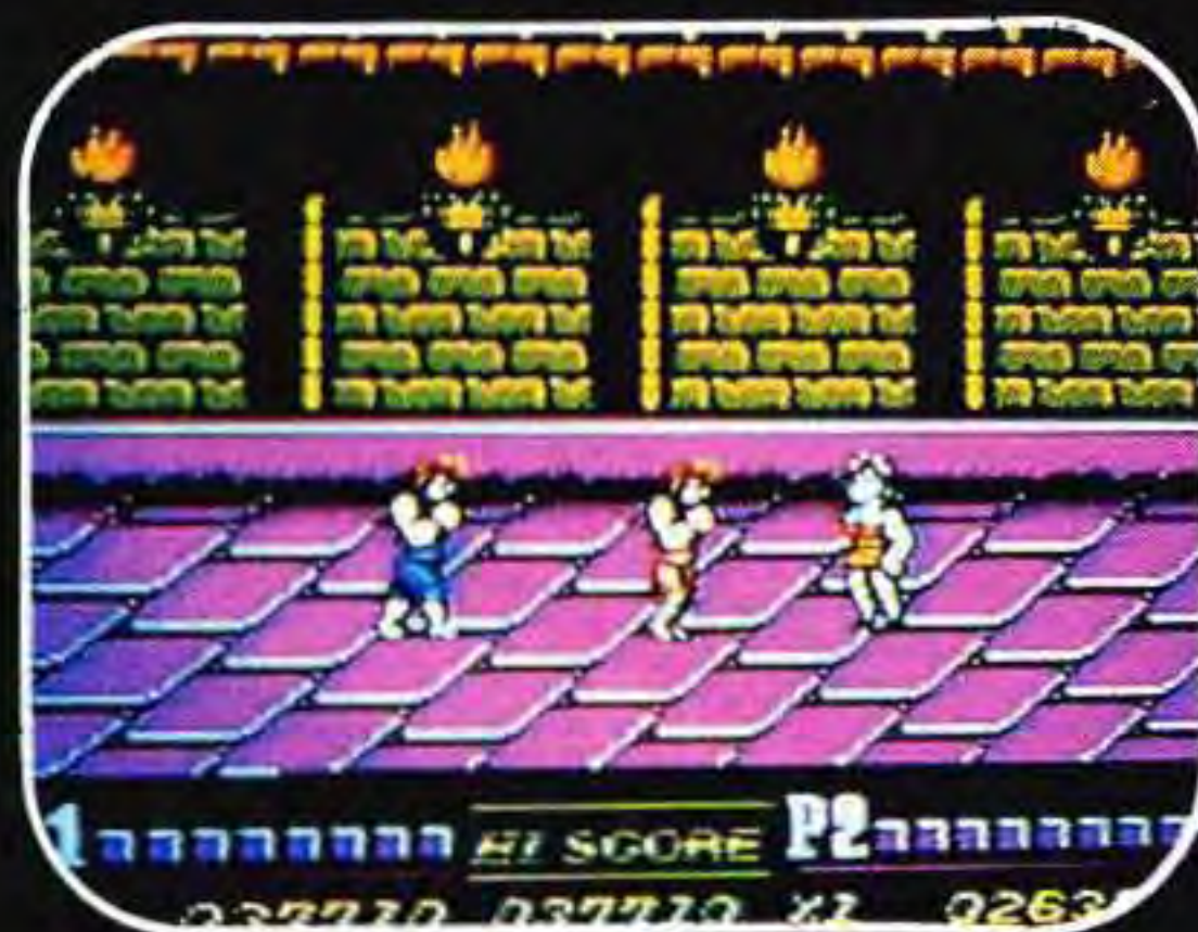
Double Dragon II: It's a miracle... Marion lives.